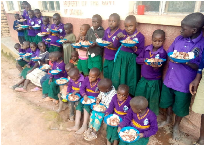
Kavumaga primary school children gather for their daily meal

The ultimate goal of WADU is to keep Batwa children in school, healthy and spiritually transformed.