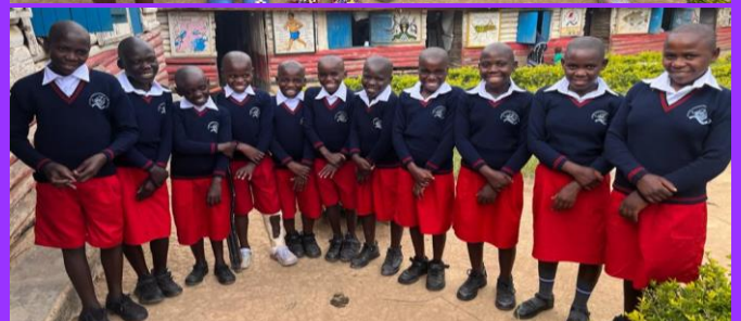
Batwa Rising Stars start a new life at a Boarding School