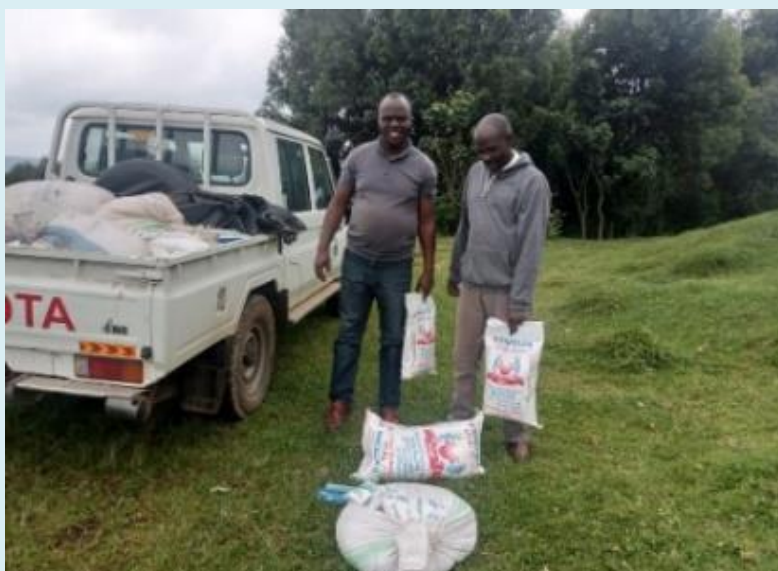
Precious during food distribution for the Batwa Partner schools at the beginning of each month