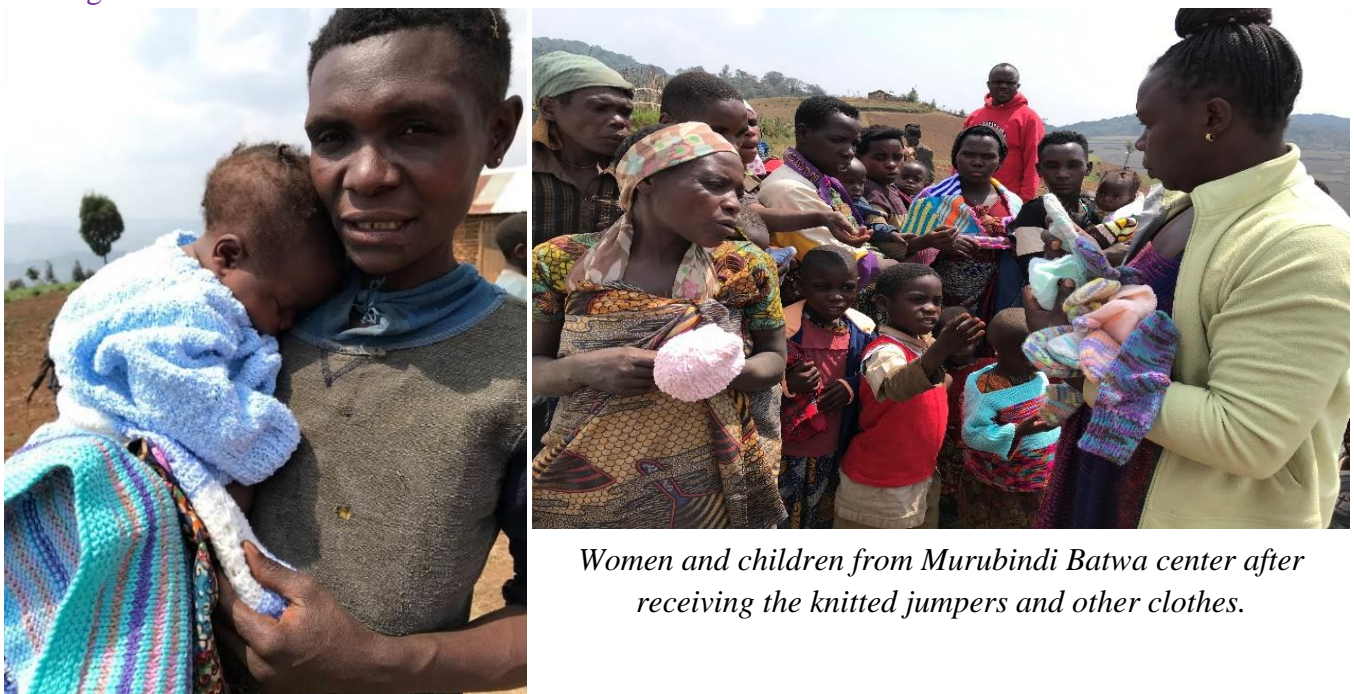
Women and children from Murubindi Batwa center after receiving the knitted jumpers and other clothes.

The joy of receiving knitted goods isn't just in the warmth it brings; it's being reassured of love and care from committed women back in the UK who spend time knitting the jumpers and baby sweaters for our Batwa communities. You're not only friends in the freezing mornings but also allies in the cold evenings.