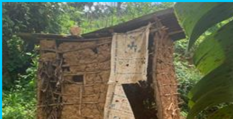
The dilapidated Toilet structure that was used by the community at Kinyarushengye